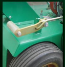
Blade engage pedal