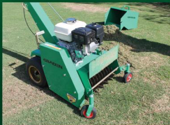
The AIRROW can operate with or without the debris catcher.

The AIRROW is the smallest verticutter in the Graden line. It has a front-mounted cutting reel to reach into confined spots. This, along with the optional debris catcher, sets it apart from its slightly bigger brother, the GS04. The AIRROW is light-weight but extremely durable, and always provides excellent results.